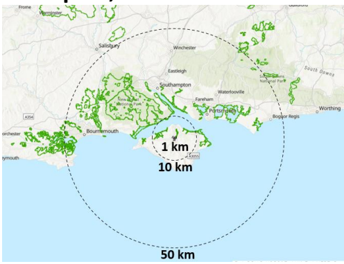
Figure 1. Scaled maps for HSS sites within 1km of Key Biodiversity Areas (KBAs), annotated with standard distance thresholds of 50km, 10km and 1km. The perimeters of KBA sites are shown in green, and the HSS site is represented by a black dot. Distance thresholds are represented by dashed lines, surrounding the HSS site and are to scale.